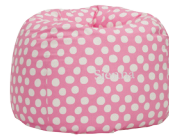
PINK PAINTED DOT