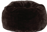
BROWN LUXE FUR