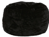
BLACK LUXE FUR