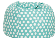
POOL PAINTED DOT