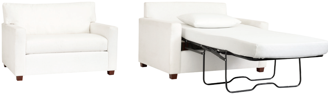
CHAIR & A HALF SLEEPER 36 x 54 x 37.5" h

The perfect solution for sleepovers, this ultra-comfy chair is simply styled with cozy cushions and pulls out into a twin-sized bed.