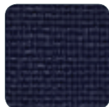
WASHED GRAINSACK NAVY