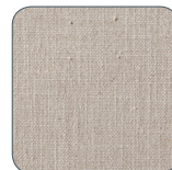
WASHED GRAINSACK FLAX