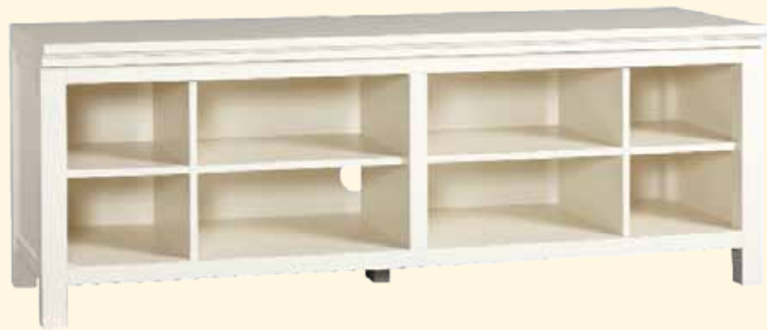
MEDIA STAND 62 x 18 x 23" h

This small space solution offers maximum media storage and will help you organize your entertainment must-haves with this roomy media stand. Set your TV up top and stow DVD players, gaming systems and accessories on the eight open cubbies below. Cord cutouts on the back and on the tabletop keep cords in place. Holds a 58" flat-panel TV.